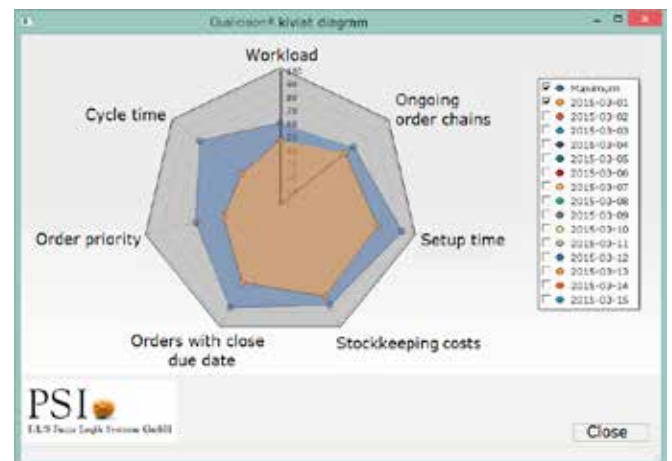
Qualicision® targets as a kiviät diagram.

Qualicision®-based modelling is performed with the help of the Qualicision® Functional Decision Design