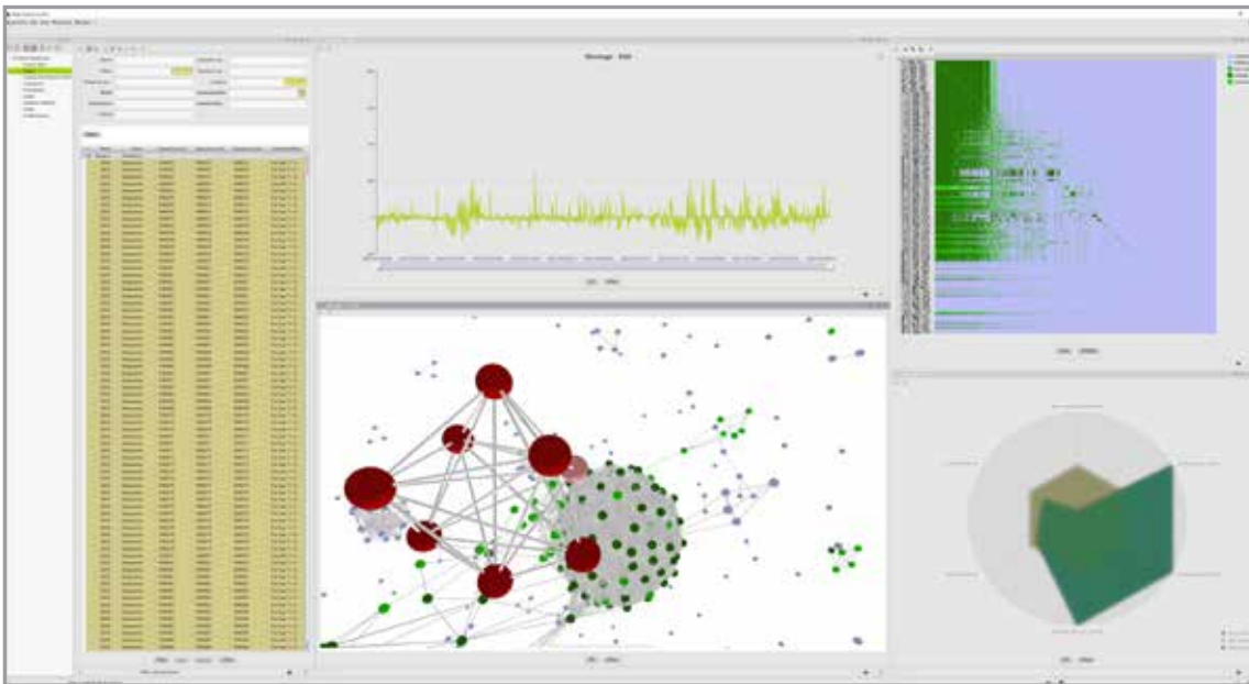
The Deep Qualicision framework.

on or off. It is implemented as an outer layer to the PSIconmand solution which is already installed and running. From the technical and the content-related point of view, the activatable Deep Qualicision AI is the blueprint for integrating machine learning into all PSI software tools that are already