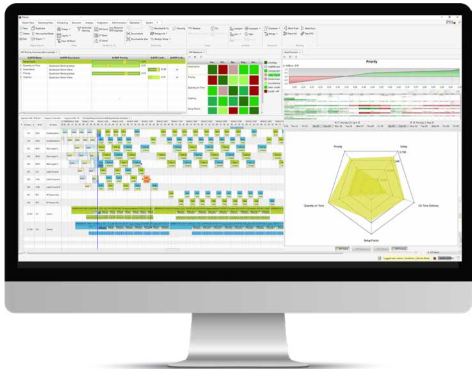
AI-based scheduling with PSIqualicision.

Companies rely on data and KPIs in order to achieve their strategic production and business goals. PSIqualicision was designed to ensure and optimize the process quality by means of intelligent data collection, analysis and balance between goal and criteria conflicts.